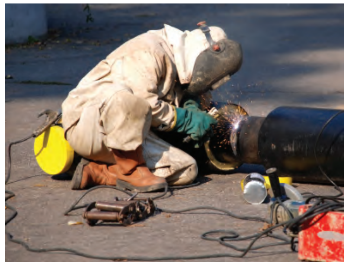
Top: Air handler unit goes in for a pharma/bio client. Bottom: Welding a connection flange for a weekend shutdown that had to be commissioned by Monday.